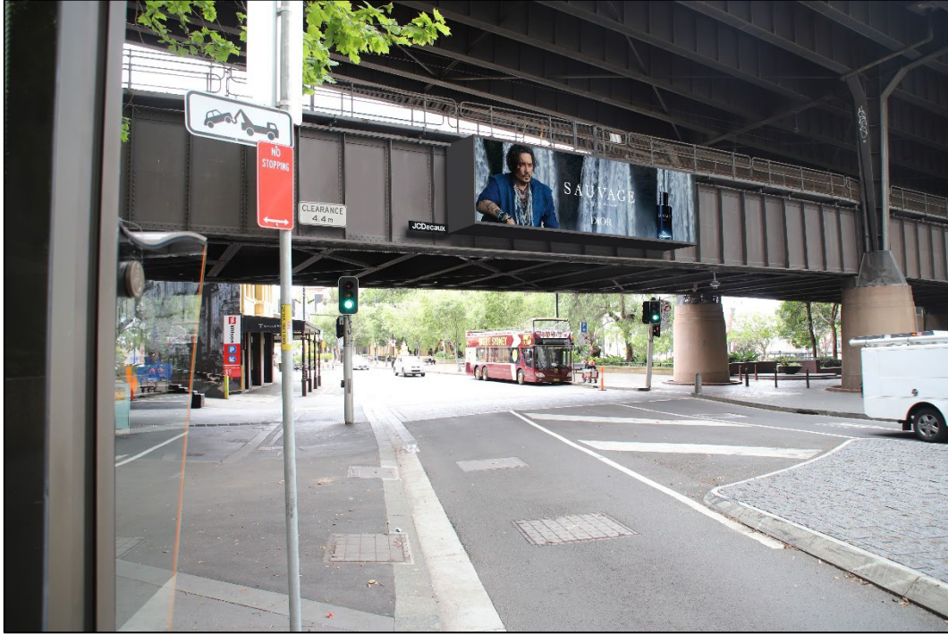
Plate 1 – Photomontage of proposed digital billboard.

Proposed works include the installation of a digital billboard on George Street, The Rocks NSW. George Street is located within the Sydney CBD, one of the most urbanised locations in Australia. It is noted that the proposed works occur in a location bereft of habitat features.